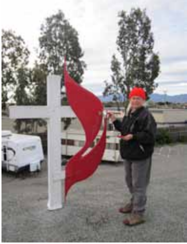
Elaine H. painting the flame

On Sunday we did a walk around to see how much work needed to be done, to figure out